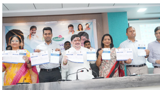
Corporation (GHMC) head office today. The program aims to gather

A major initiative to conduct a comprehensive household survey focusing on social, economic, employment, and political caste data was officially launched at the Greater Hyderabad Municipal