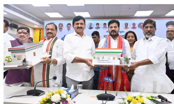
Kolkata WUT | DEC . 6

Chief Minister A. Revanth Reddy on Thursday issued a stern warning to BRS leaders, accusing them of obstructing the state government's activities without valid reasons. Specifically naming K.T.