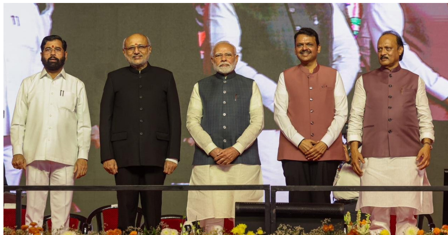
New delhi WUT | DEC . 6

Devendra Fadnavis has officially taken oath as the Chief Minister of Maharashtra for his third term during a grand ceremony at Mumbai's Azad Maidan. Shiv Sena leader Eknath Shinde and NCP's Ajit Pawar were sworn in as Deputy Chief