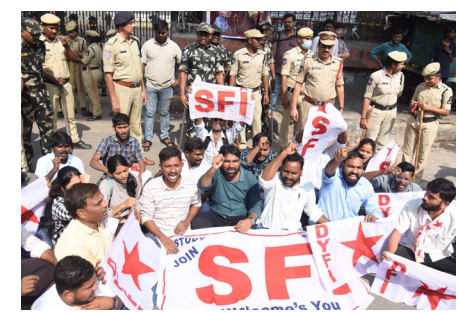
Hyderabad WUT | DEC. 6