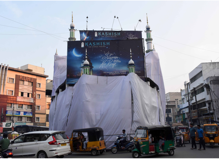
As part of security and precautionary measures during the Ram Navami procession, police covered the Siddiambhar Bazar Mosque with cloth in Hyderabad to ensure communal harmony and maintain peace in the area.