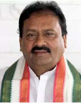
termed the Waqf Amendment Act as a direct assault on the religious and constitutional rights of Muslims and a serious infringement on the autonomy of Waqf institutions.