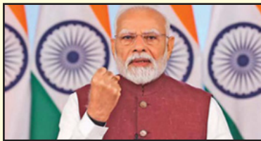
Prime Minister Narendra Modi addresses the nation, the first after Operation Sindoor, on Monday.

■ No Distinction Between Terrorists and Their Sponsors : India will treat terror groups and the states that harbor them as one and the same.