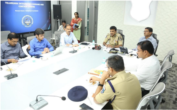
ropolitan Water Supply and Sewerage Board (HMWSSB), Telangana State Southern Power Distribution Company Limited (TGSPDCL), Hyderabad Disaster Response and Asset Protec-