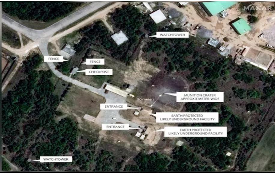
This complex is heavily protected with double fencing, its own watchtowers. With inputs: Damien Symon

patched multi-party delegations of MPs to various countries to deliver this message globally. During the meeting, Foreign Secretary Vikram Misri presented detailed information about Operation Sindoor. Congress members questioned why India is often “hyphenated” with Pakistan in US diplomacy, raised concerns over IMF aid to Pakistan, and criticized India’s abstention at an international meeting. They also voiced worries about Pakistan’s increasing ties with China. Jaishankar shared images from the meeting on social media, reiterating India’s zero-tolerance policy against terrorism in all forms and the importance of projecting a strong and unified response.