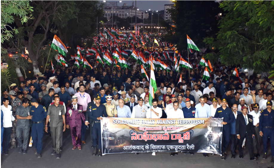
Telangana Chief Minister Revanth Reddy participated in a 'Solidarity Rally' from Telangana Secretariat to Indira Gandhi statue at Necklace Road.