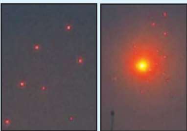
An Indian anti-drone system takes out a Pakistani drone in Channi city.

Indian forces swiftly neutralized the threats using a combination of kinetic and non-kinetic capabilities. — Defence ministry