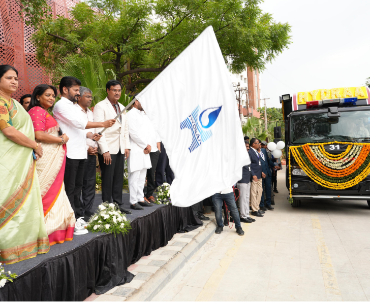
Chief Minister Revanth Reddy inaugurated the police station of the Hyderabad Disaster Response and Asset Protection Agency (HYDRAA) at Buddha Bhavan in Secunderabad.

Chief Minister Revanth Reddy on Wednesday clarified that the Hyderabad Disaster Response and Asset Protection Agency (HYDRAA) is not just about demolitions, but a broader initiative to safeguard the city's ecological and environmental balance. Speaking at the inauguration of HYDRAA's police station at Buddha Bhavan in Secunderabad, he said the agency was launched to protect lakes, ensure clean roads, restore power supply during rains, streamline traffic, and ultimately shield Hyderabad from disasters. "HYDRAA is a mission to revive Hyderabad's ecological heritage. It's about preventing floods, clearing illegal encroachments, and allowing natural water to flow freely," Revanth Reddy said. He pointed out that even short spells of rain were flooding entire colonies due to blocked drains and