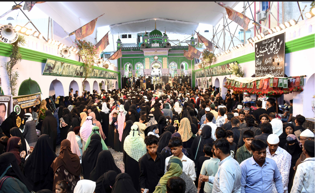
A large number of devotees throng Bibi Ka Alawa in Dabeerpura, Hyderabad.