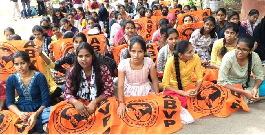
Students of Nizam College staged a protest on Friday after the college administration allegedly denied hostel accommodation to several eligible candidates.

Adding to their woes, the college mess was recently shut down due to financial issues. This has left many students—especially those residing on campus—without access to basic food services, worsening the already tense situation. The Akhil Bharatiya Vidyarthi Parishad (ABVP) has stepped in to support the students, organizing peaceful demonstrations and officially raising these issues with the administration. In a press release, the ABVP emphasized the urgent need for intervention, criticizing the administration's failure to act promptly on