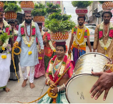
Showroom side for 'aarti' as per their customs and traditions. A total of six queue lines have been set up, and there will be two special queue lines for women coming to the temple carrying 'bonams', and a

Elaborate security arrangements will be in place with a total of 2,500 police personnel and about 50 high-definition surveillance cameras for the Ujjaini Mahankali Bonalu celebrations to be held on July 13-14. North Zone DCP Reshmi Perumal said coordination meetings were already held and suggestions taken from all the departments and temple authorities to conduct a peaceful festivity. The DCP said 'Jogins' will have to visit the temple between 1 pm and 3 pm on July 13, and they can come directly from the Bata