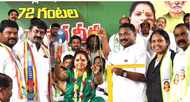
Telangana Jagruthi President and BRS MLC K. Kavitha launched a 72-hour hunger strike at Indira Park in Hyderabad on Monday, demanding 42% reservation for Backward Classes (BCs).

Centre for delays. “Putting pretexts on the Centre, Congress wants to wring its hands. BJP says it’s a state matter. Then who will give BCs their