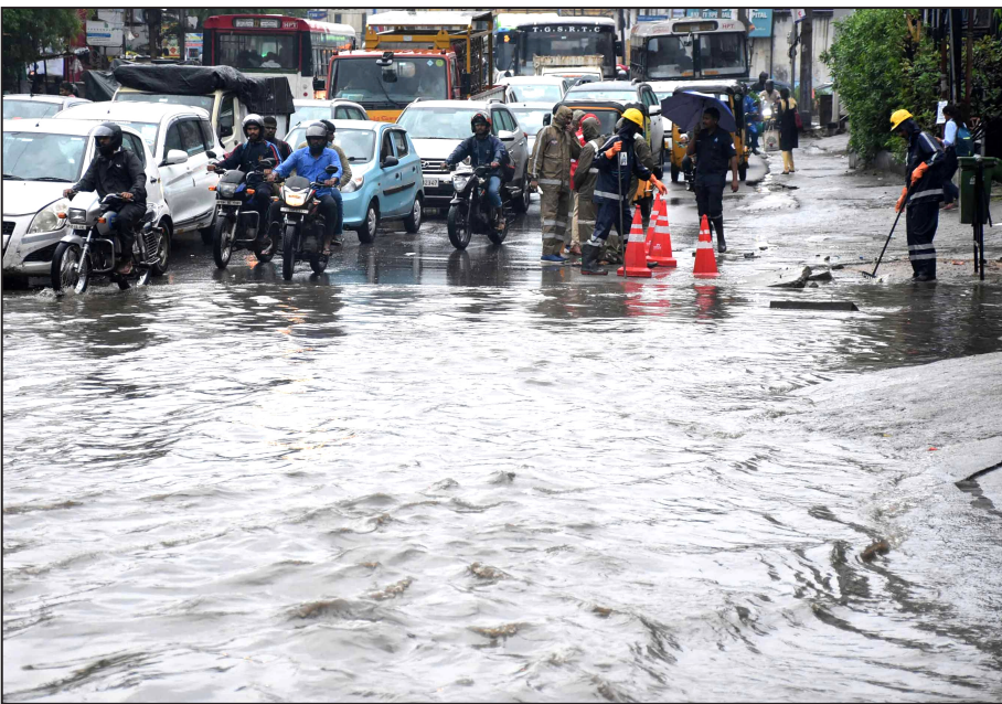
Heavy downpour lashes Hyderabad, bringing parts of the city to a standstill and disrupting normal life.

The commission, whose report is set for Cabinet discussion on Monday, found that decisions—including the selection of locations for the Medigadda, Annaram, and Sundilla barrages—were taken solely by KCR, bypassing formal government processes. There was no official Cabinet approval for key project decisions, the report is