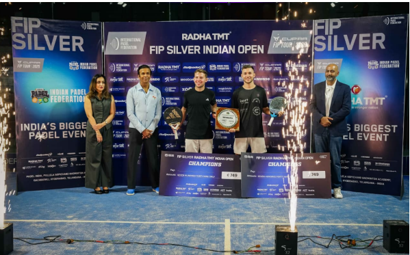
HYDERABAD Wakeup telangana