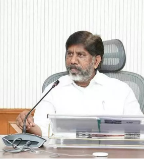
partment and Gurukul institutions. Bhatti instructed that Rs 51.36 crore be released towards pending diet, rent, and other expenditures of all SC Gurukuls, hostels, and related institutions across the state. Similarly,

Deputy Chief Minister Mallu Bhatti Vikramarka has directed officials from the finance department to release Rs 163 crore towards pending dues related to SC and Minority Gurukul Educational Institutions — including diet charges, rent, and midday meal payments, immediately. On Wednesday, the Deputy Chief Minister held a review meeting at Praja Bhavan with officials from the finance de-