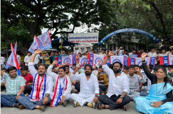
Hyderabad, demanding the immediate release of

Hundreds of BC, SC, and ST students pursuing engineering, pharmacy, MBA, MCA, B.Ed, nursing, and other professional courses in private institutions staged a protest at the Telangana Council of Higher Education office in Masab Tank,