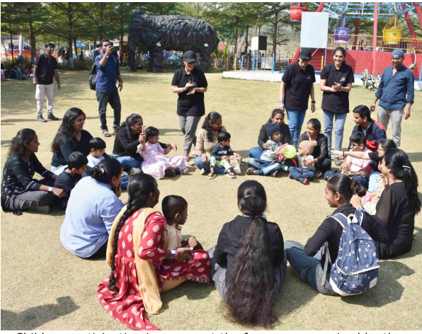
Children participating in games at the fun camp organized by the Institute for Vision Rehabilitation, L V Prasad Eye Institute.

Around 400 children with visual impairment, along with their siblings and parents from the Institute for Vision Rehabilitation (IVR) of the L V Prasad Eye Institute (LVPEI), came together for a joyful day-out at Wild Waters, a 30-acre amusement theme park in Shankarpally. The event highlighted inclusion, confidence and togetherness, reflecting IVR’s mission of empowering children beyond the limits of medical intervention. The day-long outing was designed to ensure safe, inclusive and engaging experiences for every child. Games, rides and water activities were thoughtfully adapted to different sensory needs, allowing children to participate confidently while parents and siblings remained close by for encouragement and support. Separate lawns hosted group games curated by