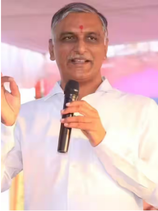
farmers, women, and the

true tribute lies in realizing his ideals. Rao praised Chief Minister KCR’s initiatives to honor Ambedkar, including naming the State Secretariat after him and erecting a 125-foot statue. Turning to governance, Rao sharply criticized Telangana Chief Minister Revanth Reddy for his handling of agriculture, irrigation, and state projects. He alleged that Revanth Reddy’s anti-farmer policies have left