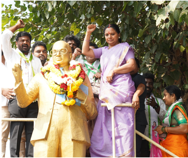
Ambedkar’s statue in the Assembly during the

Kalvakuntla Kavitha emphasised that all democrats in Telangana are working tirelessly every day to realize Dr. B.R. Ambedkar’s vision. She highlighted that the state’s creation, guided by Article 3, reflects Ambedkar’s principles and the collective effort of democrats across Telangana. Kavitha recalled the role of Jagruti in championing