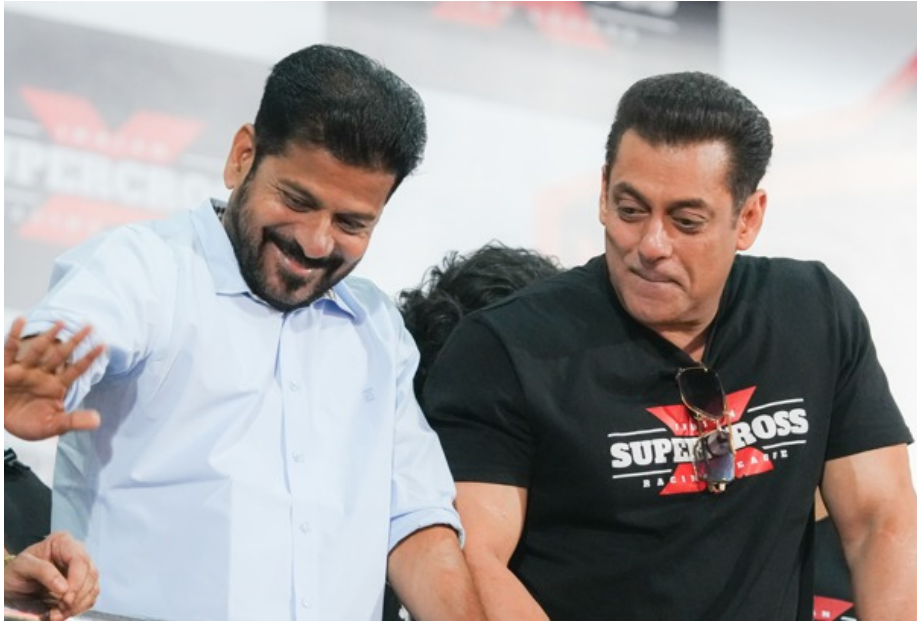
HYDERABAD Wakeup telangana

CM Revanth Reddy And Salman Khan at the Indian Supercross Racing League Hosted in Hyderabad