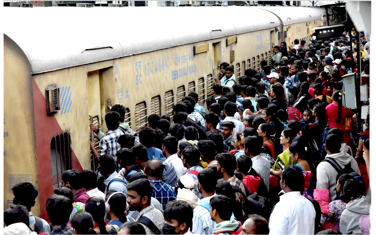
Rush of passengers seen at Secunderabad Railway Station, Hyderabad, as people leave for their native places ahead of Sankranti.