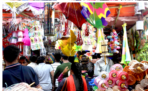
Ahead of the Sankranti festival, residents were seen purchasing colorful kites and threads from temporary stalls set up near Gulzar Houz. The bustling markets reflected the festive spirit as people prepared to celebrate the traditional kite-flying festivities across the city at Hyderabad.