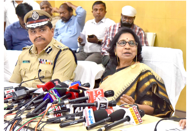
Municipal Elections Scheduled: State Election Commissioner Rani Kumudini announced during a press conference held at the State Election Commission office in Hyderabad

The Telangana State Election Commission (SEC) on Tuesday announced that municipal elections will be held on February 11, and counting of votes on February 13. Elections will be held through ballot papers, and on party symbols. Elections will not be held for the GHMC whose term ends on February 10. The polls will cover seven municipal corporations and 116 municipalities. Indirect elections for the posts of mayor and deputy mayor in municipal corporations