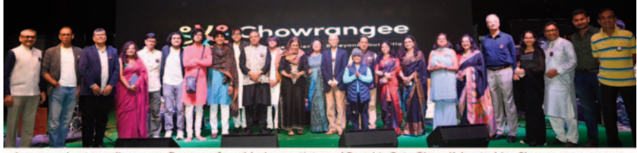
A rare and extraordinary confluence of world-class artistry - 'Gayaki, Gat, Ghazal', hosted by Chowrangee, a new-age platform dedicated to arts and culture in the city of Hyderabad, today at Taramati Baradari.