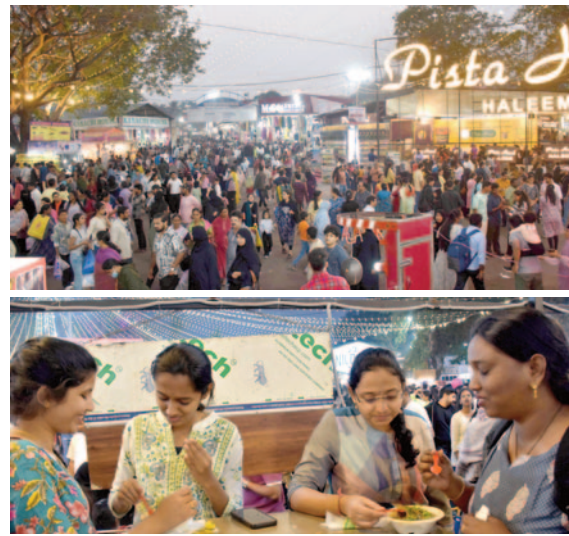
Visitors savour Pista House haleem while enjoying the festive atmosphere at the 85th Numaish in Nampally.

wider audience. Special attractions, live performances, and interactive displays added to the festive spirit, keeping visitors engaged throughout the day. Safety and crowd management measures were also in place to ensure a smooth experience for all. Overall, Sunday's turnout at the 85th All India Industrial Exhibition reflected its continuing popularity as a cultural, commercial, and social gathering, appealing to visitors of all ages.