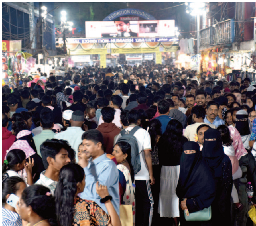
A massive crowd throngs the 85th All India Industrial Exhibition on Sunday as visitors spend time with family and friends, shop at various stalls, and relish a wide variety of food items.

Organizers highlighted that the exhibition not only provides entertainment but also promotes small businesses and artisans, helping them reach a