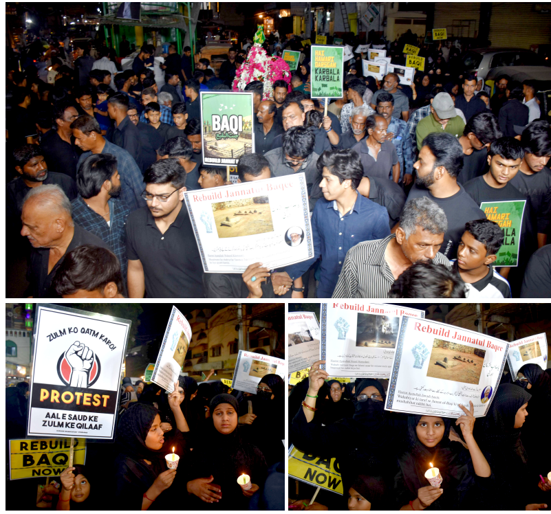
Shia Muslims held a candlelight mourning rally across Hyderabad demanding reconstruction of Jannat al-Baqi in Medina

Thousands of members of the Shia community participated in a large procession in Hyderabad on Saturday, marking over 101 years since the demolition of Jannat-ul-Baqi in Saudi Arabia, while strongly demanding its reconstruction. The rally began from Alawa-e-Bibi in Dabeerpura and concluded at a replica (Shabeeh) of Jannat-ul-Baqi at Chaderghat. Organisers said thousands of devotees joined the six-hour-long procession, observed annually on the 8th of Shawwal to commemorate the destruction of the sacred graves of the family of Prophet Mohammed in Madina in 1925. A detailed teak wood replica of Jannat-ul-Baqi, depicting its original structure before demolition, was carried throughout the procession. Participants recited mourning hymns (Noha) while passing through key localities and places of worship, with refreshments arranged along the route. The Hussaini Organisation, which has been organising the event for the past 21 years, stated that the procession serves as both a remembrance and a peaceful protest. The organisation, along with participants, raised a strong and unified demand for the rebuilding of Jannat-ul-Baqi. Organisers highlighted the historical and religious significance of the cemetery in Madina, which houses the graves of several members of the Prophet's family. They noted that the site faced destruction attempts in 1221, was restored by Ottoman rulers in 1818, and renovated between 1848 and 1860, before being demolished again in 1925 (8th Shawwal, 1345 AH) after