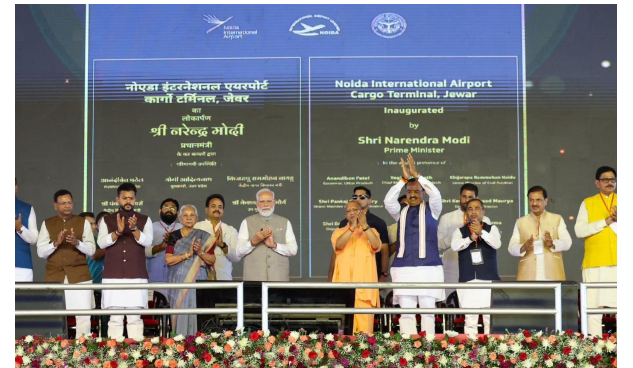
PM Narendra Modi, Civil Aviation Minister K. Ram Mohan Naidu, Uttar Pradesh Chief Minister Yogi Adityanath, Governor Anandiben Patel, and others, during the inauguration of the newly constructed Noida International Airport, in Jewar, Noida, Uttar Pradesh

Ahead of the inauguration, security was beefed up around Noida International Airport and traffic curbs were in place in view of the inauguration by Modi. The advisory will remain in force from 7 am to 11 pm on Sat-