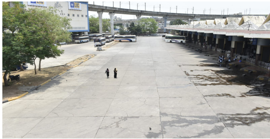
A deserted view of Mahatma Gandhi Bus Station in Hyderabad during the ongoing TGSRTC strike, as road transport services across Telangana came to a standstill following an indefinite protest launched by employees on April 22.

A statewide strike by workers of the Telangana State Road Transport Corporation (TGSRTC) began at midnight after talks between employee unions and management failed to resolve a long-standing dispute over 32 demands. The strike, involving more than 38,000 workers, is expected to severely impact public transport, with over 6,000 buses likely to remain off the roads and disrupting travel for more than five lakh passengers. With RTC services hit, a surge in demand is anticipated for alternative modes such as metro rail and MMTS trains, especially in urban centres like Hyderabad. Negotiations held earlier this week between union leaders and a government-appointed panel stretched for over four hours but ended without consensus. The panel comprised senior