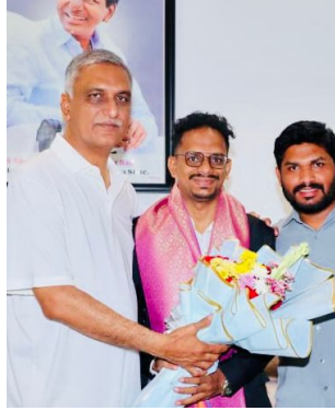
HYDERABAD Wakeup telangana