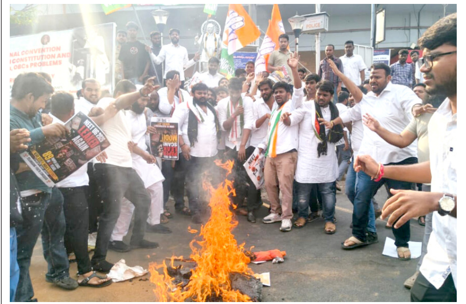
Telangana Congress burns effigies of Education Minister over NEET paper leak

The National Testing Agency (NTA) on May 12, announced the cancellation of NEET (UG) 2026 amid allegations of paper leak.