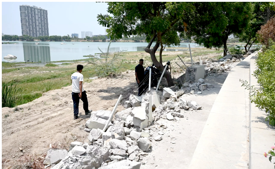
HYDRAA also removed road encroachments in Khaitalapur under Kukatpally mandal.