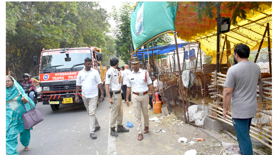
Hyderabad Traffic Police deployed special arrangements for roadside shops and vehicle parking to ensure smooth traffic movement and control congestion in busy market areas ahead of Eid-ul-Adha, as crowds gathered to purchase sacrificial animals.