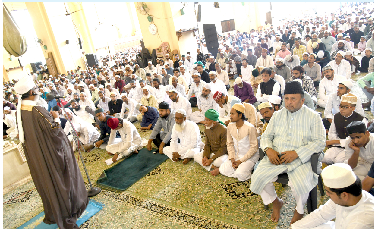
People offer Eid al-Adha prayers at Makkah Masjid in Hyderabad on Thursday