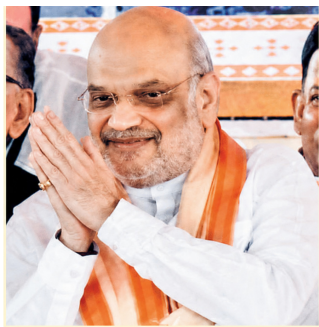
Union minister Amit Shah during the oath-taking ceremony of ministers of the Bihar government in Patna on Thursday.

Union Home Minister Amit Shah will reach West Bengal on Friday to chair a meeting with the 207 newly-elected BJP candidates of the Assembly Election to select the chief minister of the first BJP government and supervise its oath-taking ceremony in presence of Prime Minister Narendra Modi on May 9 here. A day before his visit, governor RN Ravi dissolved the existing Assembly with the end of its term after Trinamul Congress supremo Mamata Banerjee refused to resign from the chief minister's post despite losing in her home turf, Bhowanipore, and the power in the state. Mr Shah, who was earlier supposed to reach the state on Thursday, will land at the NSCBI Airport at around 12.40 pm on Friday and reach a hotel in New Town. He will hold a couple of meetings from 2 pm to 8 pm. The main agenda among them