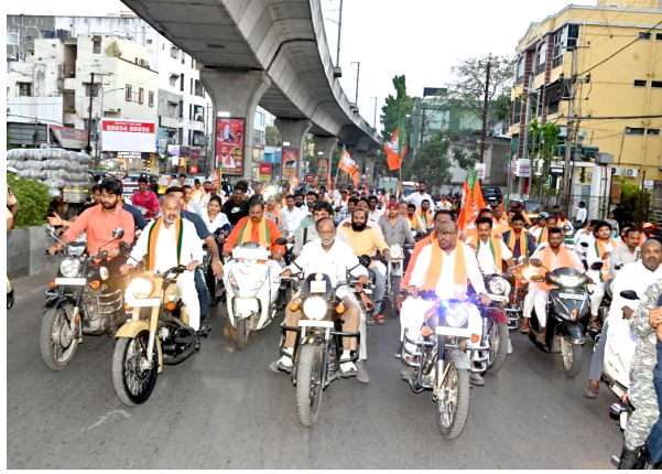
Union Minister Bandi Sanjay Kumar and Rajya Sabha MP K. Laxman led a massive BJP bike rally at RTC X Roads, Hyderabad, calling upon party workers to make Prime Minister Narendra Modi's upcoming public meeting at Parade Grounds, Secunderabad, a grand success.

Union minister of state for home affairs Bandi Sanjay Kumar on Friday claimed that Telangana's development was possible only with Central funds and accused the Congress government of siphoning off state resources to the party high command in Delhi. He contrasted this with the BJP's efforts to bring funds from the national capital. Taking part in a bike rally at RTC crossroads along with Rajya Sabha MP Dr K. Laxman and hundreds of party workers to mobilise support for Prime Minister Narendra Modi's public meeting at Parade Ground on Sunday, Sanjay highlighted the Cen-