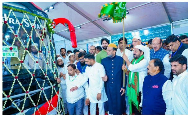
A. Revanth Reddy flagged off buses carrying Haj pilgrims at Haj House, Nampally, Hyderabad, on the occasion of their departure for the holy pilgrimage.

A. Revanth Reddy on Friday directed officials to establish special degree colleges for minority students in the headquarters of erstwhile districts, with a strong emphasis on skill development and artificial intelligence (AI) training. During a review meeting of the minority welfare department, the Chief Minister said education should go beyond conventional courses and focus on improving employment and livelihood opportunities for students. He instructed officials to formulate special schemes for meritorious minority students on par with welfare programmes available for BC, SC and ST communities. Revanth Reddy also asked officials to identify minority candidates selected for Group-1, Group-2 and Group-3 services and involve them in the functioning of the minority welfare department to provide practical exposure to welfare administration. To motivate students, he