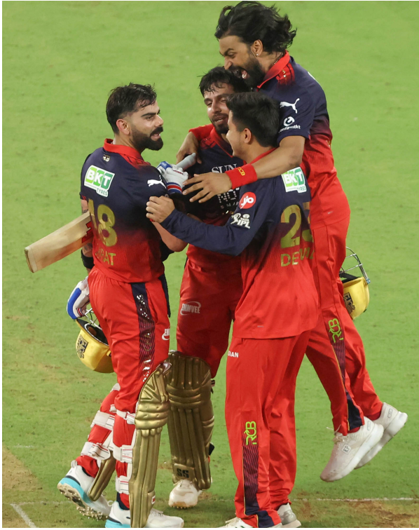
Royal Challengers Bengaluru's Virat Kohli celebrates after winning the Indian Premier League (IPL) 2026 title.

Revanth to review Employees Health Scheme rollout tomorrow