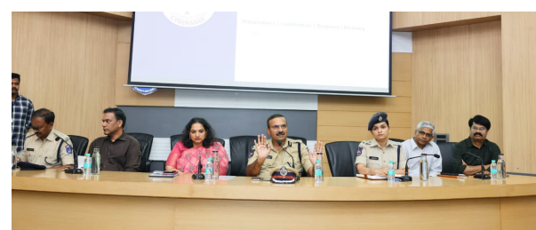
Wake Up Telangana | Hyderabad:

A high-level coordination meeting was held between Cyberabad Traffic Police, Cyberabad Municipal Corporation (CMC), the Society for Cyberabad Security Council (SCSC), and IT company representatives to strengthen monsoon preparedness, improve traffic manage-