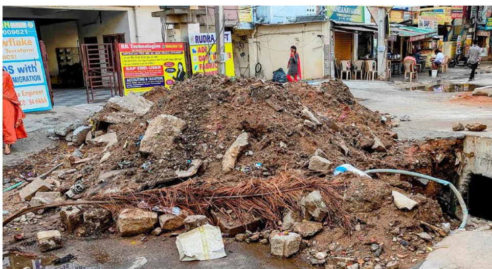
HYDERABAD Wakeup telangana

During the visit, he directed the officials concerned to revamp the existing stormwater drain by widening and remodelling it, and to complete the work on a war footing to avoid inconvenience. Residents, however, said the works were continuing at a snail's pace. The delay has been attributed to a lack of coordination between Greater Hyderabad Municipal Corporation (GHMC) and the Hyderabad Metropolitan Water Supply and Sewerage Board (HMWSSB) in completing the works. At Srinivasa Nagar, earth excavation work was seen at the stormwater drain site behind Maitrivanam, with soil