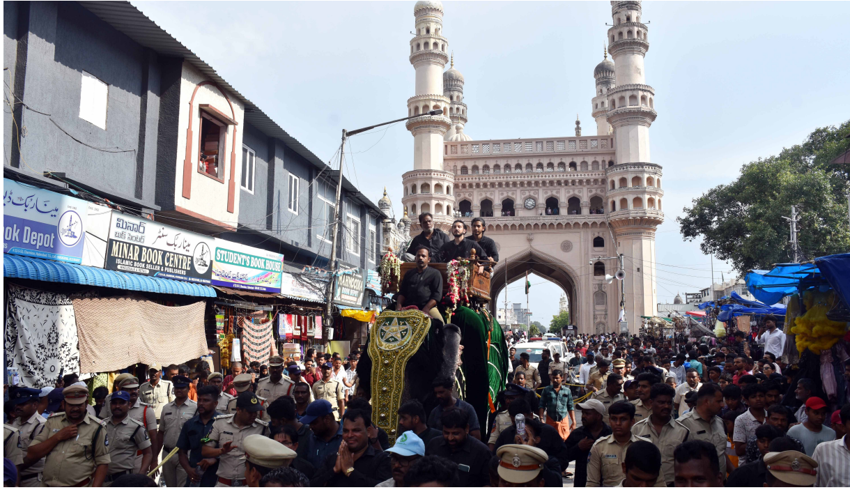
HYDERABAD Wakeup telangana

A trial run of the Bibi-Ka-Alam procession was taken out in the Old City on Saturday by the organisers of the procession. The elephant Sreedevi was arranged from Kerala and arrived in the city three days ago. The organisers of the procession, along with the Hyderabad City police, as a practice, conducted a trial run on the procession route to familiarise the jumbo with the atmosphere that prevails during the procession. The elephant passed through Yakutpura Bada Bazaar Road, Etebar Chowk,