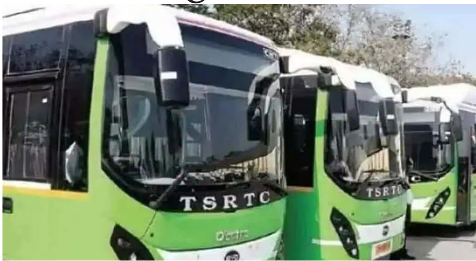
HYDERABAD Wakeup telangana

Hyderabad: A major accident was averted on Sunday, June 21, after an electric TGSRTC bus belonging to the Karimnagar-2 depot caught fire near the Lower Manair Dam (LMD) in Thimmapur mandal of Karimnagar district. According to reports, the bus was travelling from Karimnagar to Hyderabad when flames suddenly erupted from the vehicle at around 8 am. The driver acted swiftly and safely evacuated all 37 passengers on board before the fire spread. Passengers escape unharmed. The passengers escaped unharmed, but the bus was completely gutted by the blaze before firefighters could bring the situation under control. The incident