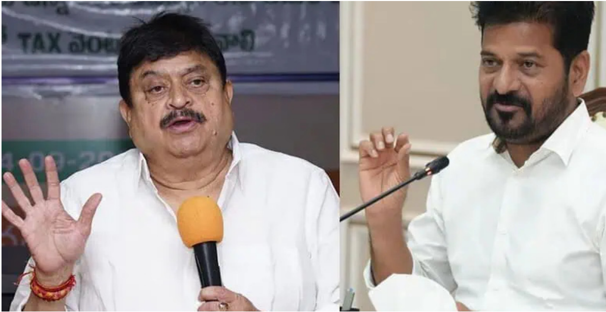
Hyderabad Wakeup telangana