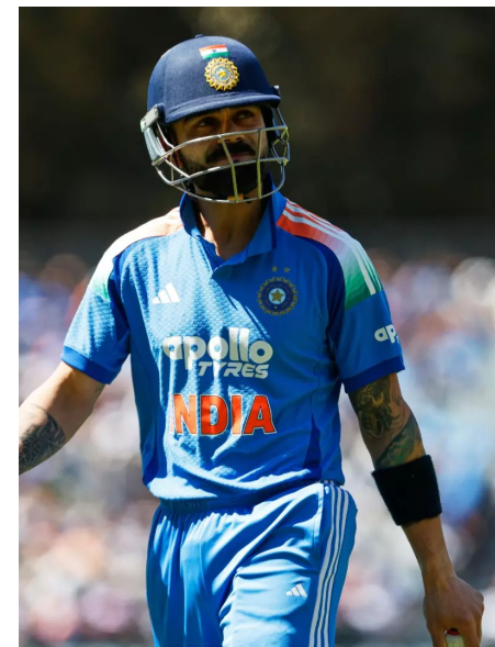
New Delhi: Wakeup telangana

Star batsman Virat Kohli was on Sunday named in India's squad for the three-match ODI series against England next month, subject to fitness clearance, as the BCCI an-