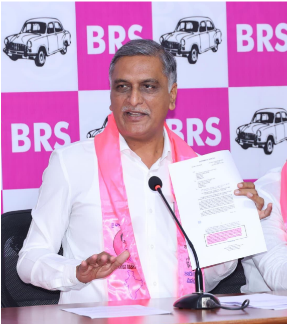
Hyderabad Wakeup telangana Hyderabad: Former Ir-

rigation Minister and BRS Deputy Floor Leader T. Harish Rao on Saturday accused Chief Minister A. Revanth Reddy of compromising Telangana's rightful share of Krishna and Godavari waters for political interests, alleging that he was "mortgaging Telangana's water rights as Guru Dakshina to his political mentor." Addressing a press conference at Telangana Bhavan, Harish Rao claimed the Congress government had failed to oppose Karnataka's proposed