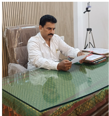
Wake Up Telangana

The Society for Crusade Against Corruption (SCAC) has raised serious concerns over the functioning of municipal authorities in dealing with illegal and unauthorised constructions. According to the organisation, there is a growing public perception that while enforcement authorities often fail to stop violations at the initial stage, the tax section appears to wait until the buildings are completed before imposing penalties and collecting additional taxes. SCAC questioned whether the priority of the municipal administration is to prevent illegal construction or to generate revenue through penal assessments. It argued that if timely inspections and enforcement are carried out during the construction stage, many