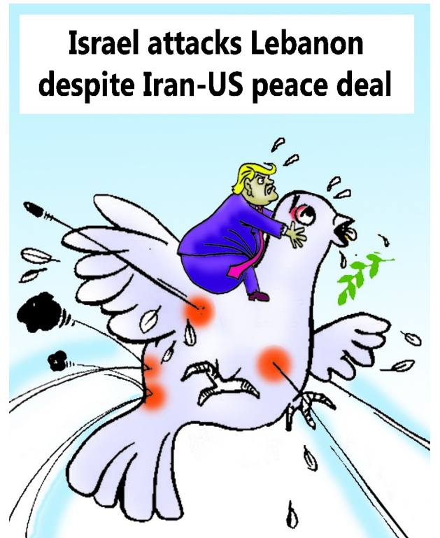
Israel attacks Lebanon despite Iran-US peace deal