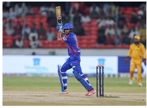
Hyderabad Wake Up Telangana