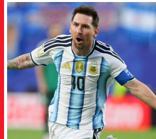
Mumbai: WAKE UP TELANGANA

Mumbai: As the FIFA World Cup 2026 group stage comes to an end and the tournament moves into the Round of 32, the biggest football spectacle on the planet has already delivered unforgettable moments, record-breaking performances, and stories that define the magic of the World Cup. The tournament began with the spotlight firmly on football's biggest names, Lionel Messi, Cristiano Ronaldo,