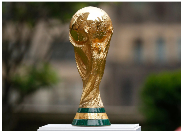
Wake Up Telangana

FIFA expanded the World Cup to 48 teams from this edition, and as in previous tournaments, the top two teams from each of the 12 groups automatically qualify for the Round of 32. Additionally, the eight best third-placed teams across all groups also advance to complete the knockout bracket. Following the completion of the group stage on Sunday, the final list of the eight best third-placed