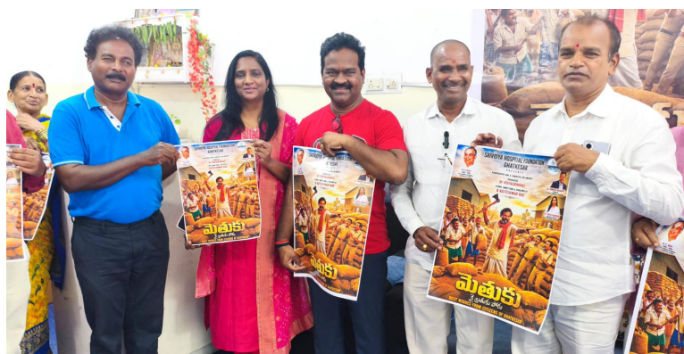
Wakeup Telangana Medchal Malkajgiri District