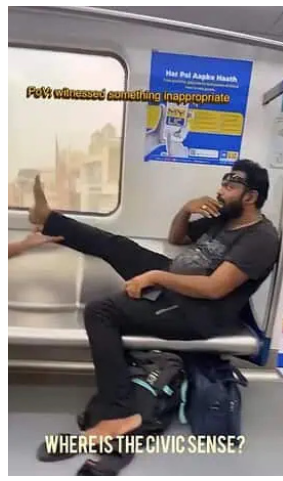
Video of a man putting his bare feet up on the seat and not budging even after other passengers confronted him has sparked a fresh debate on civic sense. The video, which surfaced on social media on June 1, shows a man brazenly resting his leg near the window, right next to another passenger. When others asked him

People using the Hyderabad Metro have to deal with inconveniences every day – from overcrowded trains at all hours to people watching reels on full volume without headphones and men occupying seats in the ladies' compartment. Now, a video of a man putting his bare feet up on the seat and not budging even after other passengers confronted him has sparked a fresh debate on civic sense. The video, which sur-