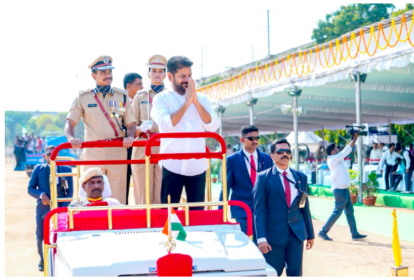
Chief Minister A. Revanth Reddy hoists the National Flag, reviews the ceremonial police parade, and receives the Rashtriya Salute during Telangana State Formation Day celebrations at the Parade Grounds in Secunderabad.

Chief Minister A. Revanth Reddy on Tuesday unveiled an ambitious vision to transform Telangana into a global economic powerhouse, stating that his dream was to position the state not merely as a gateway to India but as a gateway to the world. The roadmap for achieving this goal has been outlined in the "Telangana Rising-2047" Vision Document, he said while addressing the Telangana Formation Day celebrations at the Parade Ground in Secunderabad. Owing to the intense summer heat, Revanth Reddy concluded his address early. Although a 16-page speech had been prepared, he read only the first nine pages and skipped the remaining