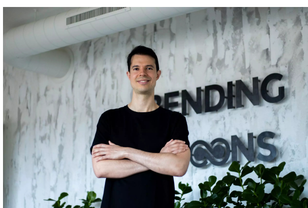
Hyderabad: Wakeup telangana Bending Spoons is set

for its U.S. market debut later on Wednesday after the Italian technology company priced its