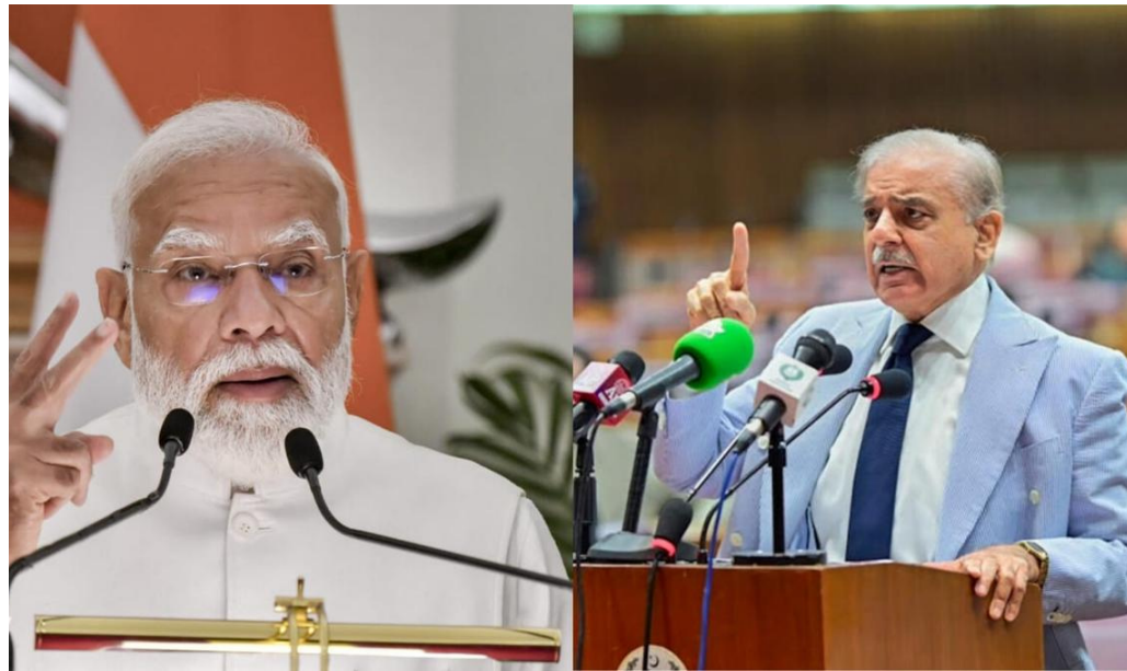
region. The initiative of the joint letter, addressed to Indian Prime Minister Narendra Modi and Pakistani PM Shehbaz Sharif, was spearheaded by O.P. Shah, who is

ity and a secure future. At least 117 individuals from India and Pakistan, in a joint open letter, on Wednesday (July 1, 2026), asked Prime Ministers of India and Pakistan to re-open bilateral dialogue, resume discussions on J&K, demilitarise and de-escalate for a lasting peace in the region. ster Narendra Modi, and Pakistan's PM Shehbaz Sharif. At least 117 individuals from India and Pakistan, in a joint open letter, on Wednesday (July 1, 2026) asked Prime Ministers of India and Pakistan to re-open bilateral dialogue, resume discussions on J&K, demilitarise and de-escalate for a lasting peace in the