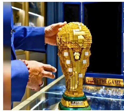
Wake Up Telangana