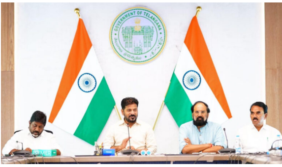
Hyderabad Wake up telangana

Hyderabad: Telangana Chief Minister A Revanth Reddy has proposed an integrated system of traffic signals across Hyderabad and the adoption of high-tech solutions for hassle-free traffic management. Analog