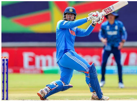
Wake Up Telangana

New Delhi: Former India selector Sarandeep Singh wants to see Vaibhav Sooryavanshi in the Indian playing eleven for the T20 series opener against England in Durham. Sooryavanshi did not get to play in the series against Ireland that world champions India lost 0-2. If he plays against England on Wednesday, he would become the youngest cricketer to play for India. He should have played (against Ireland). The team manage-