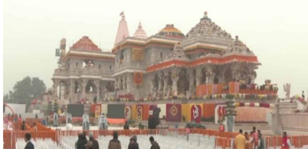
Wake Up Telangana

Unnao: A BJP MLA has stirred a controversy after a viral video purportedly showed him saying that those involved in the embezzlement of donations at the Ram temple in Ayodhya would be af-