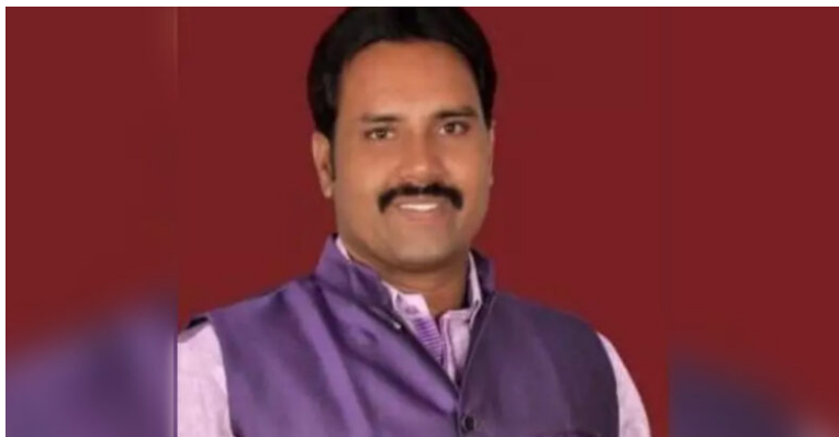
Wake Up Telangana