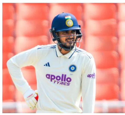
Wake Up Telangana

Colombo: India's two-Test series against hosts Sri Lanka will be played in Galle and Colombo from August 15 to 27, the home board SLC announced on Thursday. The series is part of the World Test Championship. The first Test will be played at the Galle International Stadium from August 15, while the second will be at the SSC from August 23, read a statement from Sri Lanka Cricket. India, who have made two finals but never won the WTC title, are currently fifth in the standings, while Sri Lanka are sixth. India will also tour New Zealand this year for a two-match Test series in November-December. History