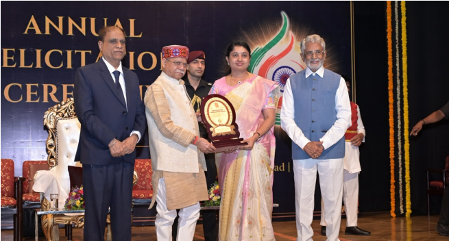
HYDERABAD Wakeup telangana

KLH Bachupally Campus has been conferred the Institutional Excellence Award by the Shri P. V. Narasimha Rao Memorial Charitable Trust, recognising the institution's exemplary contribution to social service, community engagement, and humanitarian initiatives. The prestigious award was presented by the