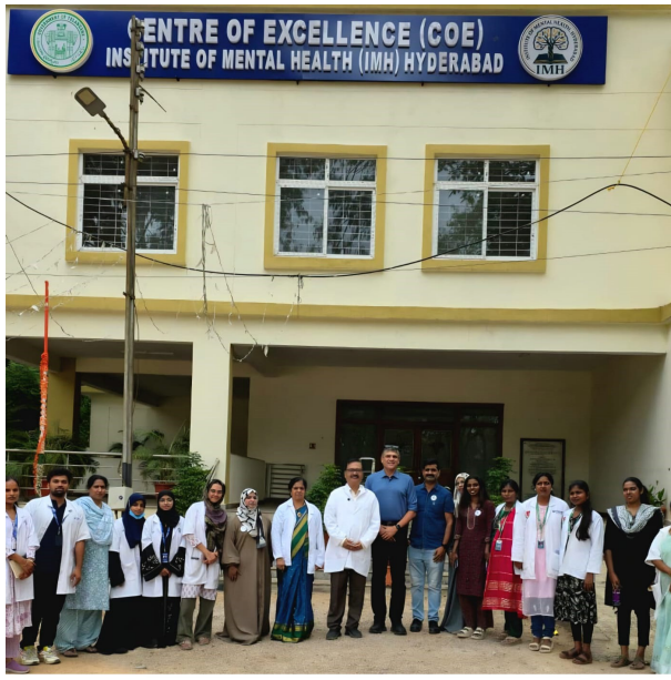
Hyderabad, Wake Up Telangana

Hyderabad, July 2026: The state-run Institute of Mental Health (IMH), Eragadda, has introduced dedicated Psychiatric Social Counselors to strengthen patient care and rehabilitation through a collaboration with Helping Hand Foundation (HHF). Five trained psychiatric social workers have been deployed across the discharge ward, de-addiction ward, clinical psychology department, OPD, and pharmacy to provide counseling, family support, and social reintegration services. In the last 30 days alone, 17 patients