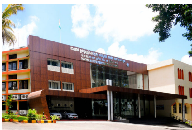
Hyderabad: Wakeup telangana

CSIR-NIIST on Thursday, July 2, said it has signed a Memorandum of Understanding (MoU)