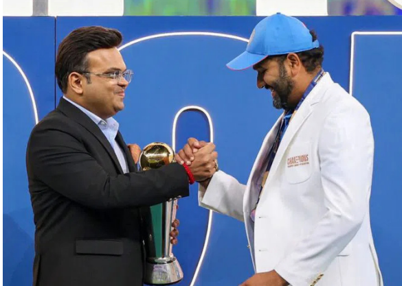
Wake Up Telangana

New Delhi: Union Minister for Youth Affairs and Sports Mansukh Mandaviya and International Cricket Council (ICC) chairman Jay Shah on Thursday extended their wishes to the sports media fraternity on the occasion of World Sports Journalists Day, recognising the invaluable contribution of journalists in promoting sport, celebrating athletes'