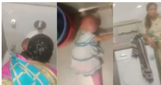
Wake Up Telangana