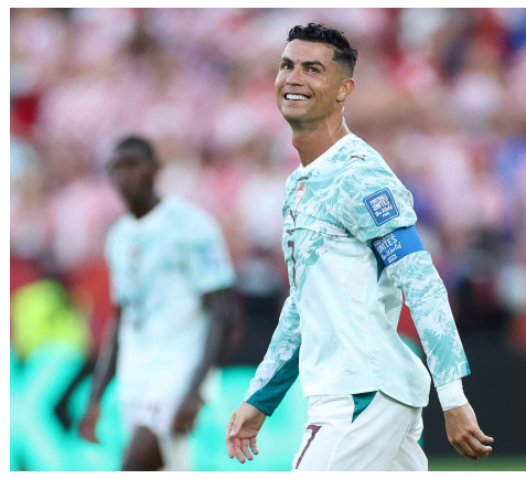
Wake Up Telangana