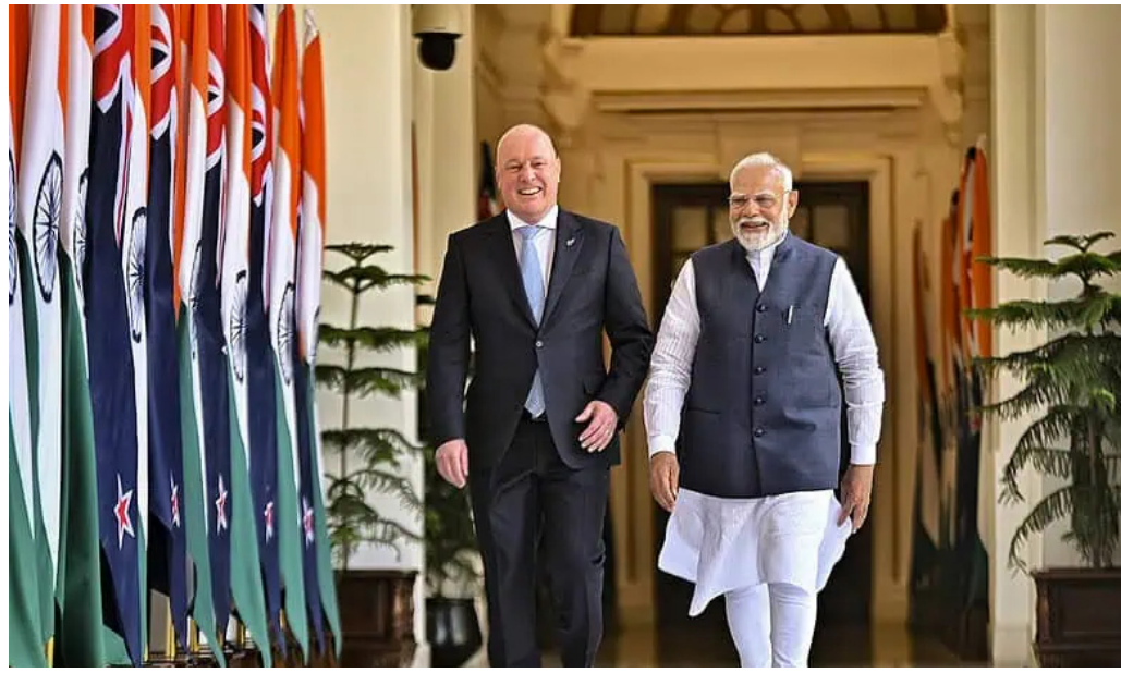
New Zealand PM said, "We will also be celebrating the people-to-people connections between our two countries, with Kiwi-Indians comprising around 6 percent of New Zealand's population and making a significant contribution to our country. They are highly engaged across the workforce, with strong representation in business, technology, health, science and many other important sectors. This visit is about celebrating a winning partnership between New Zealand and India - one that delivers for our people and supports greater prosperity and security for both our countries. I look forward to welcoming Prime Minister Modi to New Zealand." The Indian Prime Minister will arrive in Auckland on Friday, July 10 and depart on Saturday, July 11. During the visit, Prime Minister Modi is expected to hold bilateral talks

New Zealand", he said. It will reduce or eliminate tariffs on 95 per cent of New Zealand's exports to India once fully implemented. From day one, 57 per cent of our exports will be tariff-free", he added. This will unlock new opportunities to grow our goods and services exports into a market of 1.4 billion people and contribute to achieving the Government's goal of building the future by doubling the value of exports by 2034. "The visit reflects the growing momentum in the New Zealand-India relationship. Discussions between the leaders will include trade and investment, maritime security, education, technology, tourism, sport, and global issues.