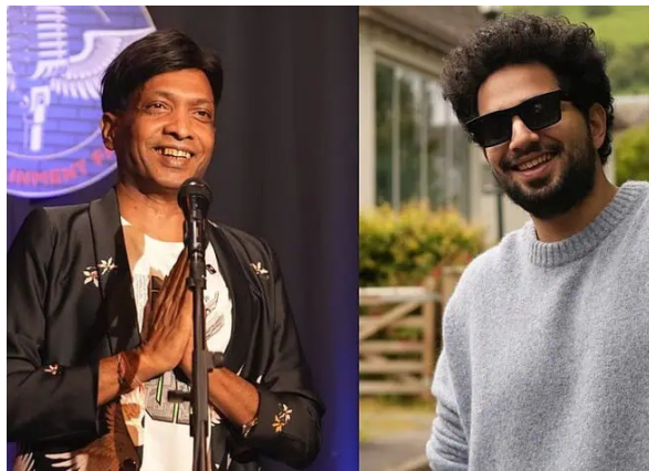
Wake Up Telangana

Mumbai: Comedian Sunil Pal has once again put India's Got Latent 2 in the spotlight, this time with a money claim that is already grabbing attention online. According to a viral post, Sunil Pal claimed that Samay Raina recently invited him to appear on India's Got Latent 2. The comedian reportedly said he was offered Rs 25 lakh for the appearance, but decided to turn it down. Sunil Pal says