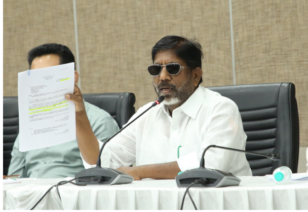
Telangana Deputy Chief Minister Mallu Bhatti Vikramarka addresses a press conference at Praja Bhavan in Hyderabad on Wednesday. He alleged that the Centre was misleading the public over the Tadicherla-II coal block, stating that it was not a fresh allocation but only the approval of a mining lease granted to the Singareni Collieries Company Limited (SCCL) in 2013.

Deputy Chief Minister Mallu Bhatti Vikramarka on Wednesday accused the Centre of misleading the public over the Tadicherla-2 Coal Block, stating that the Union government had not made a fresh allocation to the Singareni Collieries Company Limited (SCCL) but had only granted the long-pending prior approval for the mining lease. Addressing a media conference at Praja Bhavan, Bhatti Vikramarka refuted Union Coal Minister G. Kishan Reddy's claim that the BJP-led Centre had allotted the Tadicherla-2 Coal Block to SCCL.